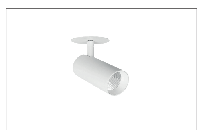
Light. For Generations.