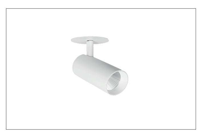
Light. For Generations.