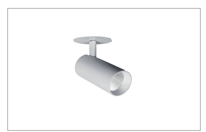
Light. For Generations.