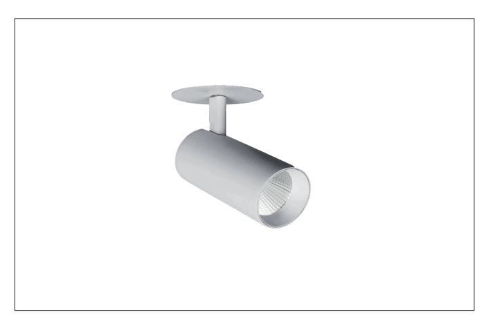
Light. For Generations.