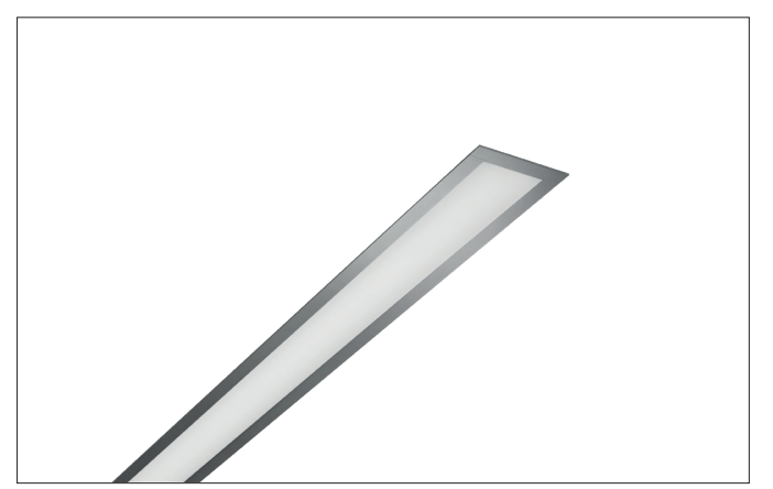
Light. For Generations.