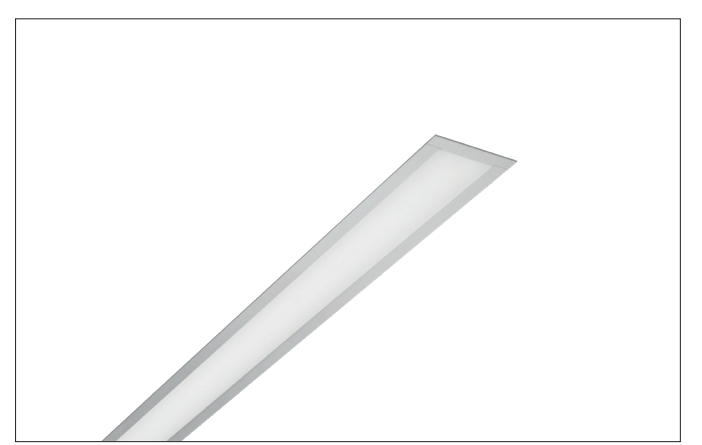
Light. For Generations.