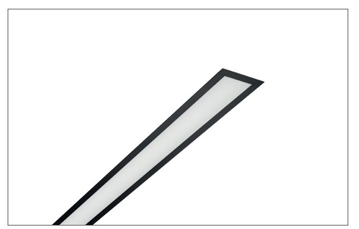
Light. For Generations.